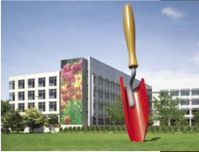
Plantoir, Meredith Headquarters