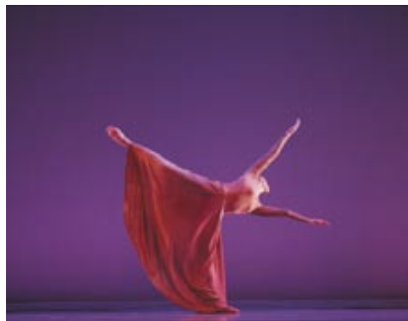
Dallas Black Dance Theatre