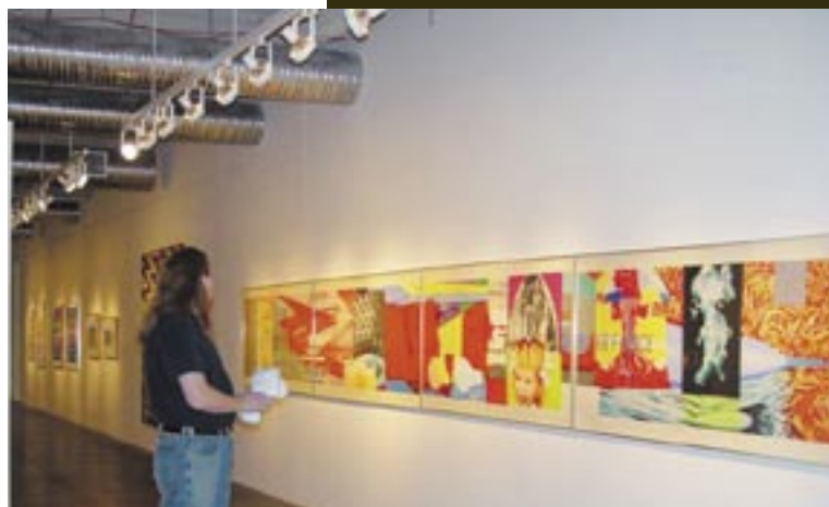
Des Moines Art Center Downtown