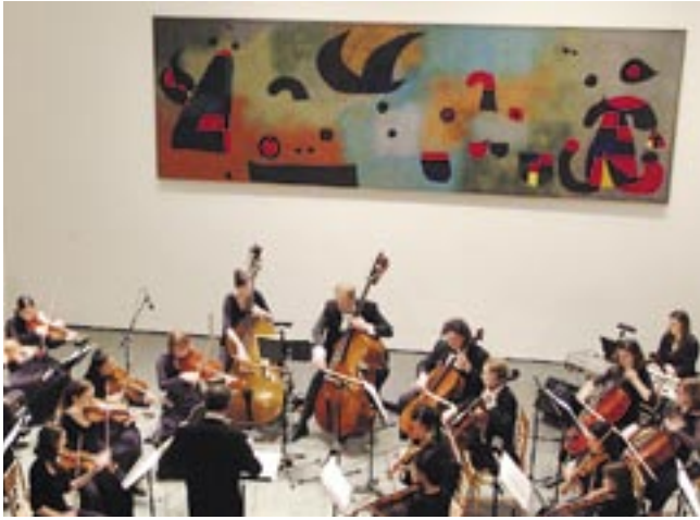
Client Reception at Museum of Modern Art

UBS actively promotes its sponsorships through local and national advertising in print and radio, as well as direct mail and communications with its clients. Each ad is designed to communicate that the partnership between UBS and the arts is a partnership of shared values. This approach builds brand association for UBS and a “buzz” for arts organizations.