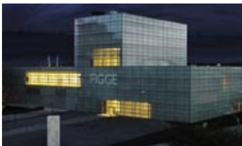
Figge Museum of Art