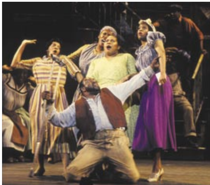
Houston Grand Opera

Through its worldwide offices the firm has negotiated and secured support for several major landmark exhibitions, including Kremlin Gold —an exhibition of Russian gems and jewels owned by the Fersman Mineralogical Museum, Moscow; Masters, Impressionists and Moderns: French Masterworks from the State Pushkin Museum, Moscow ; and the Dead Sea Scrolls —the most comprehensive exhibition to date from the Dead Sea Scrolls Foundation.