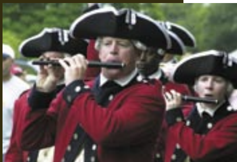
Old Guard Fife and Drum Corps Virginia International Tattoo

Norfolk Southern employees are encouraged to volunteer to assist the arts and the company offers them and their families opportunities to participate in the arts. To foster individual giving, the company maintains a dollar-for-dollar employee matching gift program. In 2004, Norfolk Southern matched gifts to 208 arts organizations, up 16% from the previous year.