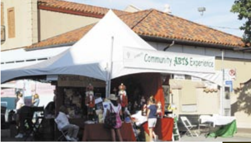
Kansas City Plaza Art Fair