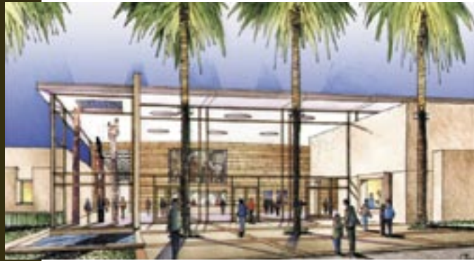
The Bowers Museum of Cultural Art –North Wing Design

Nominated by The Bowers Museum of Cultural Art Santa Ana, California