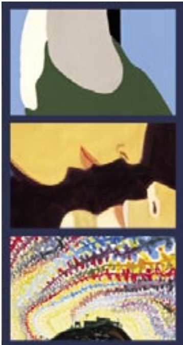
Paint the City

Nominated by Greater Hartford Arts Council Hartford, Connecticut