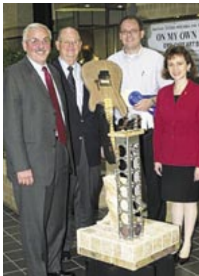
On My Own Time