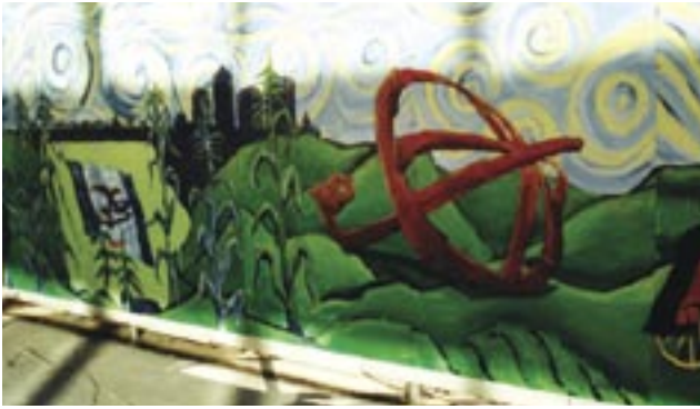
Construction Site Mural