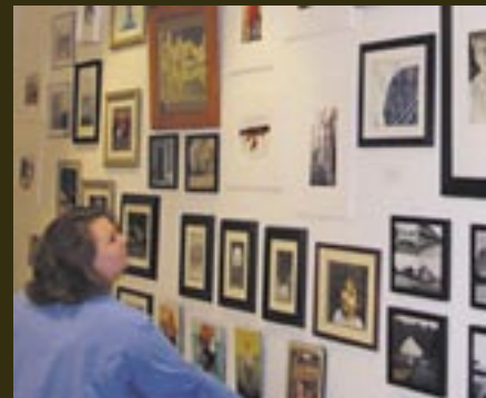
art@work-A Celebration of Art