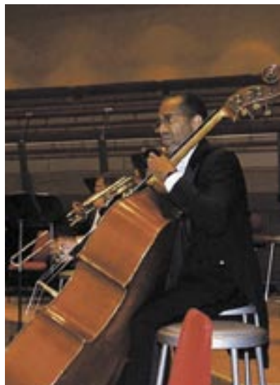
Dallas Symphony Orchestra

American organizes many receptions and events for its customers and clients in conjunction with the exhibitions and performances it sponsors. It recently invested more than $6 million in art displayed in and around Terminal D of the Dallas/Fort Worth Airport to enrich the customer experience. And, it exhibits works of art from its own and local collections in its Admiral Clubs and other airports throughout the world. It also developed and maintains the American Airlines C.R. Smith Museum in Fort Worth devoted to the history of flight.