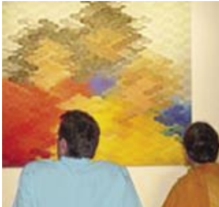
Des Moines Art Center Downtown

Nominated by Des Moines Art Center Des Moines, Iowa