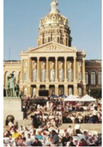
July 4 th Pops Concert