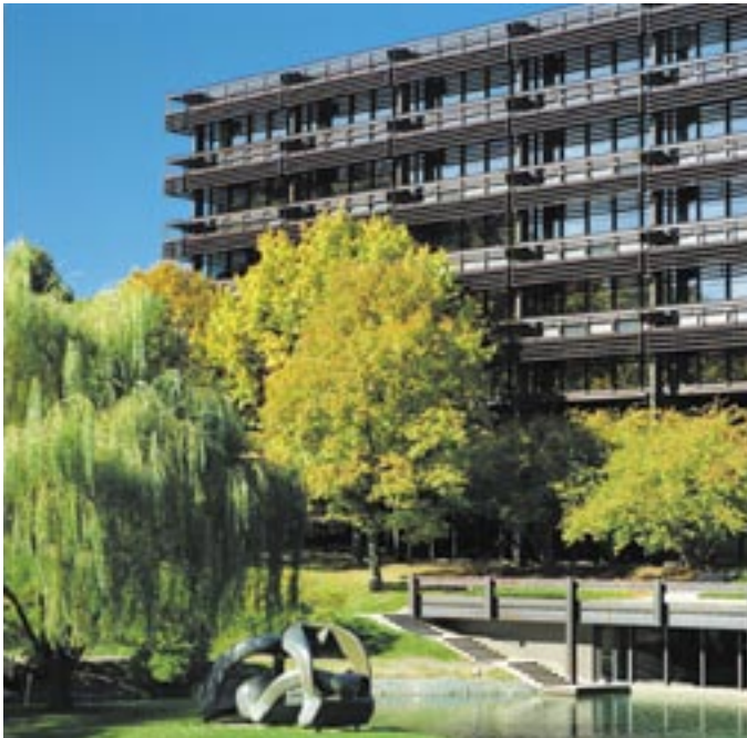
Deere World Headquarters