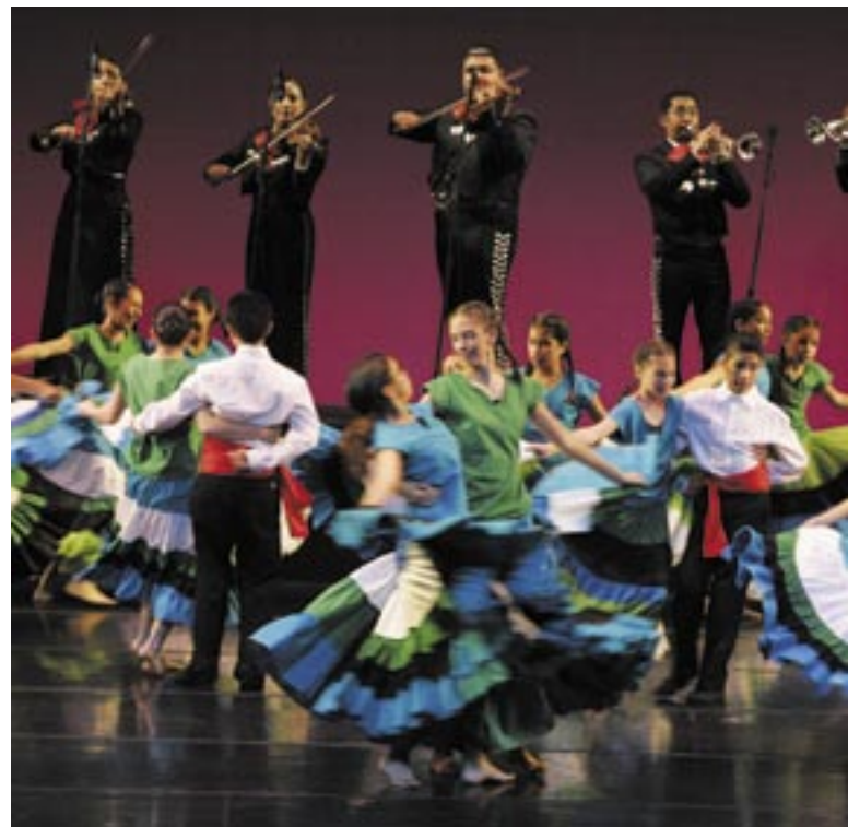
Saint Joseph Ballet

The company also maintains an archival collection of 15,000 photographs depicting the history of Orange County from its inception to present times. Nearly 2,000 of these images are on display in its headquarters and employees may request copies for their personal use. These photographs are also available to newspapers and book publishers.