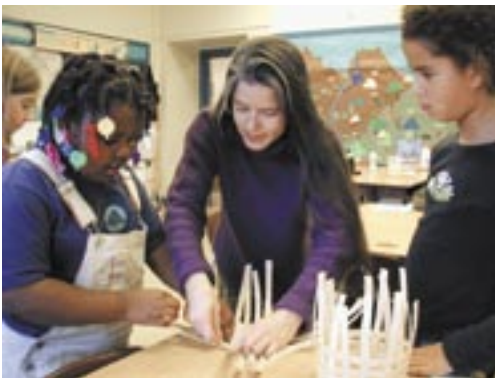
Young Audiences, Portland, Oregon

Nominated by Metro Arts Alliances Des Moines, Iowa