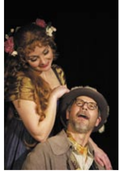
Mendelssohn's A Midsummer Night's Dream Virginia Arts Festival

Nominated by Virginia Arts Festival Norfolk, Virginia